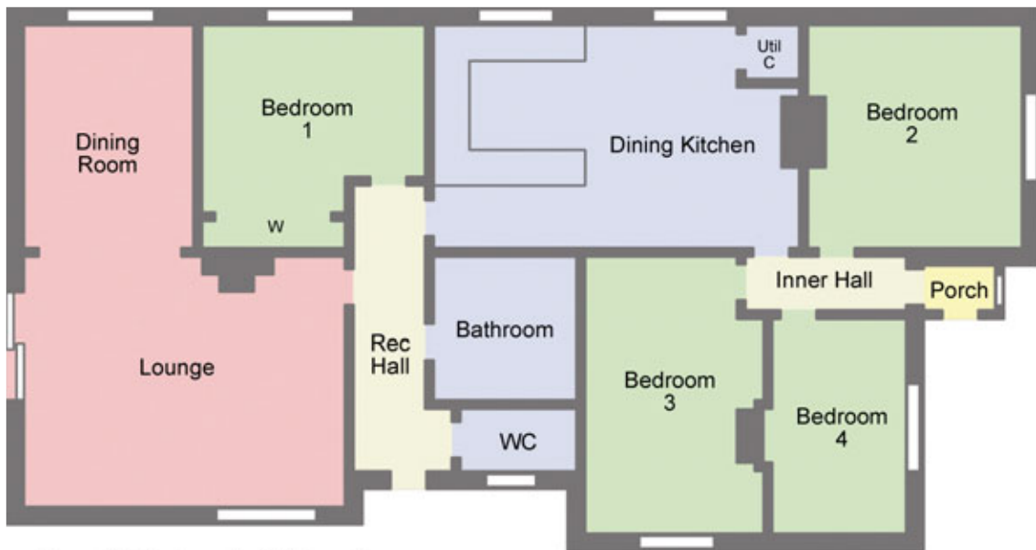
Schematic Diagram only - Not to scale